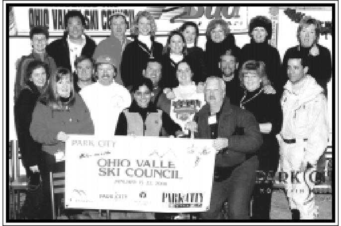
PARK CITY, JANUARY 2000