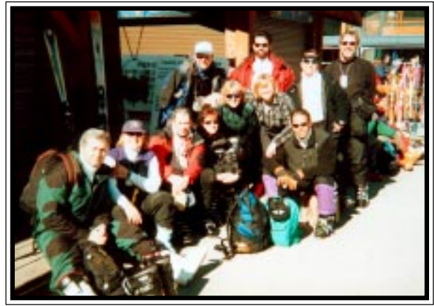
Chamonix, France - March 2000 16 CSCers waiting to conquer Aiguilledumidi